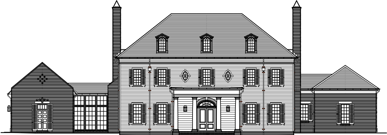
Example of an Elevation